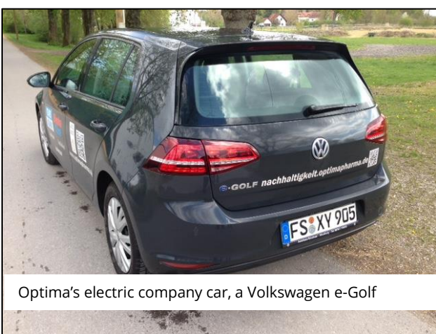
Optima's electric company car, a Volkswagen e-Golf

Regarding energy use for transportation and packaging, Optima is working continuously on optimizing production structure and processes. One example is the restructuring of production for one of our main products.